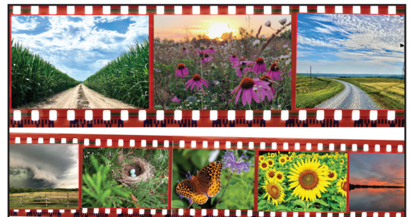
2023 WINNERS AS SEEN ON DIRECTORY