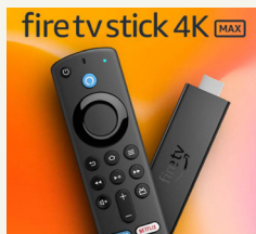
Fire TV Stick 4K Max, Wi-Fi 6, Alexa Voice Remote