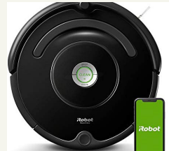
iRobot Roomba 694 Robot Vacuum-Wi-Fi Self-Charging